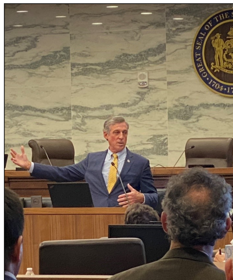
ABOVE Gov. John Carney speaks in Courtroom 7E at the Leonard L. Williams Justice Center before the Dec. 18, 2023 groundbreaking at the historic Custom House.