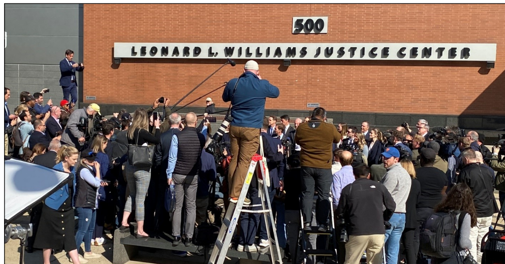
BELOW Attorneys address the media crowd outside the Leonard L. Williams Justice Center following the announcement of a settlement in the Dominion Voting v. Fox News/Fox Corp. civil suit in Superior Court on April 18, 2023.