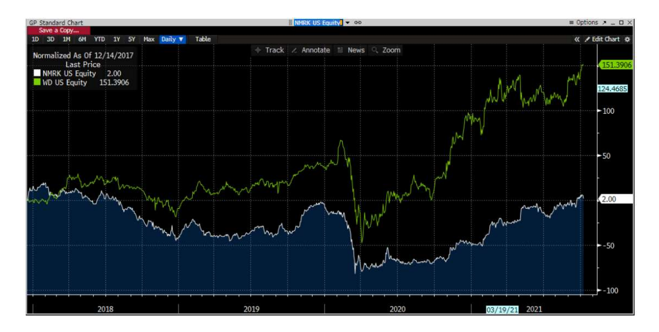
A3190. That would not have happened if BP and W&D were so comparable that W&D's multiples could have been applied to BP's economics without adjustment. The trial court ignored this market evidence, favoring Defendants' unsupported and conclusory "illustrative" analysis instead.