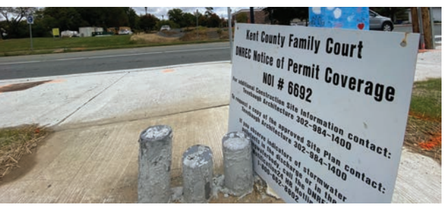
Estimated Completion: Winter 2026