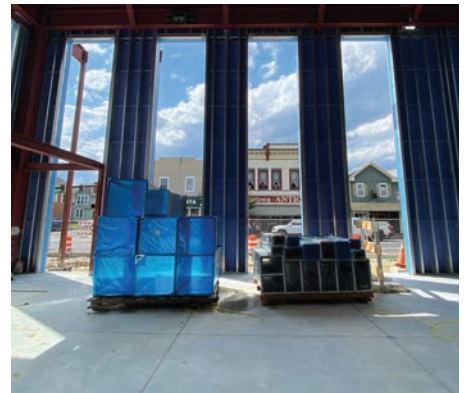
Estimated Completion: Spring 2026