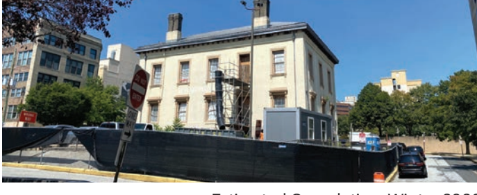
Drone images, and interiors and rendering of Custom House, Tevebaugh