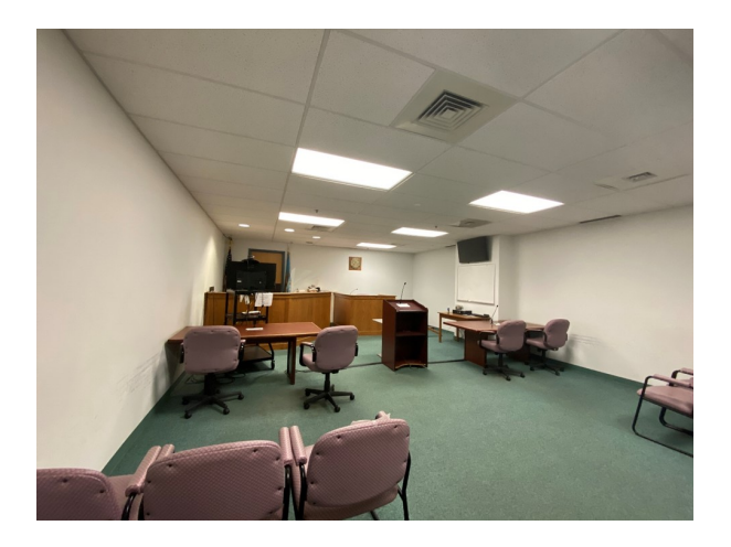
JP 20 Courtroom