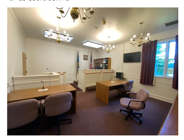
JP 10 Courtroom 2