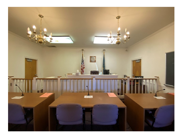
JP 10 Courtroom 1