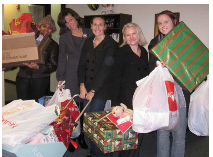
OCA staff and friends prepare to deliver holiday gifts to children served by OCA

Many of OCA's clients were "adopted" and provided with an abundance of thoughtful gifts during the FY11 holiday season by organizations such as the 9th Airlift Squadron of the Dover Air Force Base, the Christiana Rotary Club, the Crossroads Presbyterian Church, and the Eastpoint Community Church. Members of these organizations rallied to collect thoughtful, individualized gifts from the wish lists of these children, and 230 of OCA's clients benefited from the kindness of these organizations. A family from the KMC Girls Gymnastics Team also "adopted" an OCA client, providing him with the new bike he desired, as well as other gifts. All of these donations were a great help to the families caring for OCA's child clients, and enabled these children to enjoy a happier holiday.